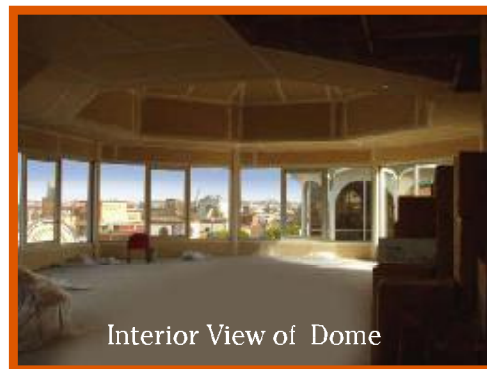
Interior View of Dome

Prominent 900 sq ft entrance with elevator 10,518 sq ft with 750 sq ft observation deck Immediate leasing opportunity Ready for its own special identity