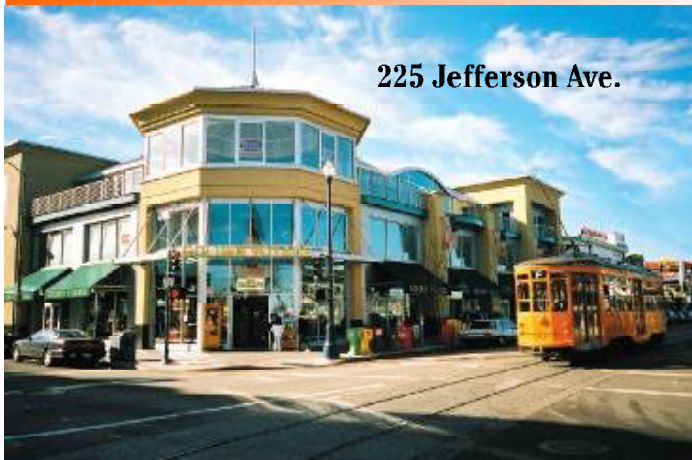
225 Jefferson Ave.

Fantastic Space in a World-Class Location